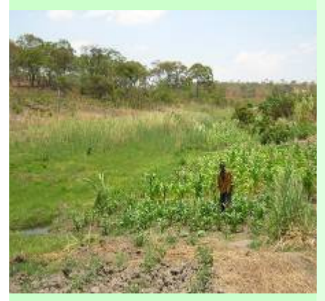
Maintaining natural vegetation in the centre of wetlands is essential for protecting these areas