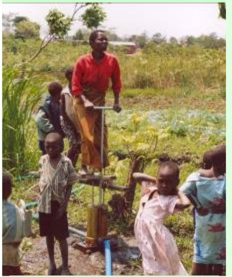
Treadle pumps extract more water from wetlands & require monitoring