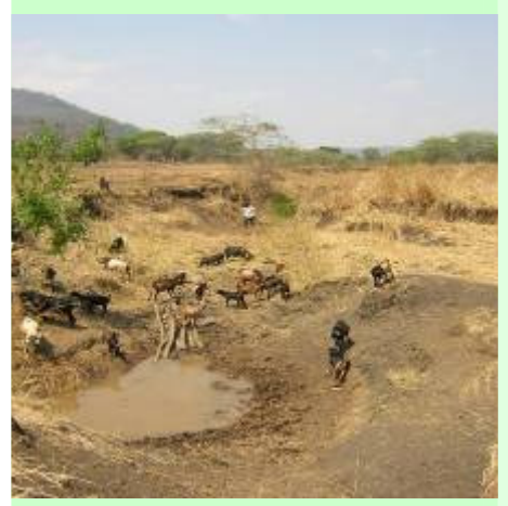
Gulley formation is common in wetlands which are overused and where there are degraded catchments

been the use of wetlands for cultivation, with the fringes of large permanent wetlands and extensive parts of smaller seasonal wetlands brought into use. Indeed, wetlands are a "new agricultural frontier" in Africa today.